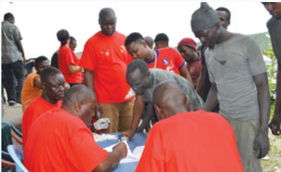
TB is curable, take action...