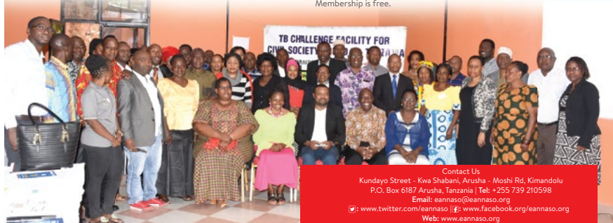
TB is curable, join us today to end TB in Tanzania