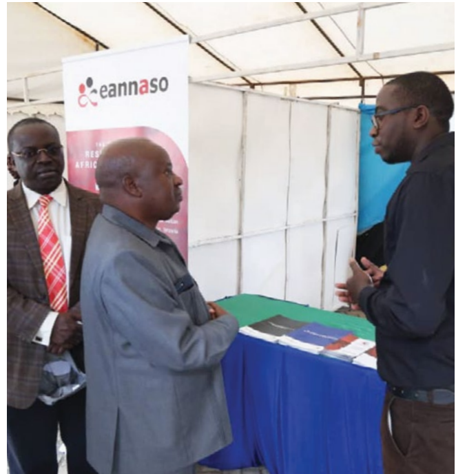
TTCN Secretary meeting the Honorable Speaker of the Tanzania Parliament

The results showed that, while communities were involved in the TB response, their activities were not coordinated and they did not speak with one voice. This was mainly due to the lack of a mechanism to enable the diverse and geographically widely located TB actors to engage formally with one another. On the basis of these findings, there was a recommendation to invest in a community platform to improve communication, coordination and networking and enable a more formal and harmonized engagement of all organizations already implementing community-based TB activities, thereby enhancing advocacy efforts, supporting the dissemination of good practices and improving service delivery outcomes.