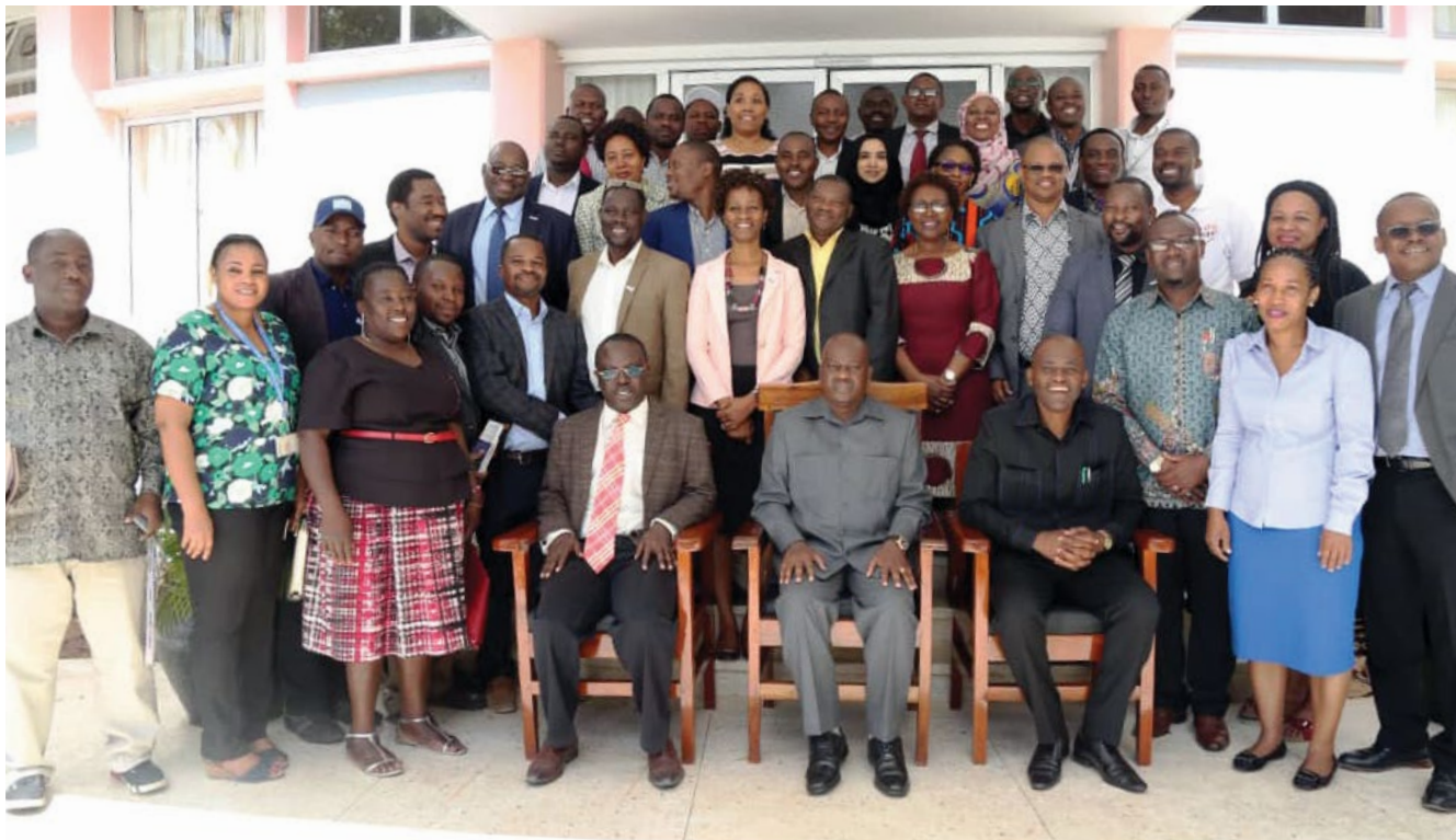
TTCN Secretariat meeting with key parliamentarians in Tanzania