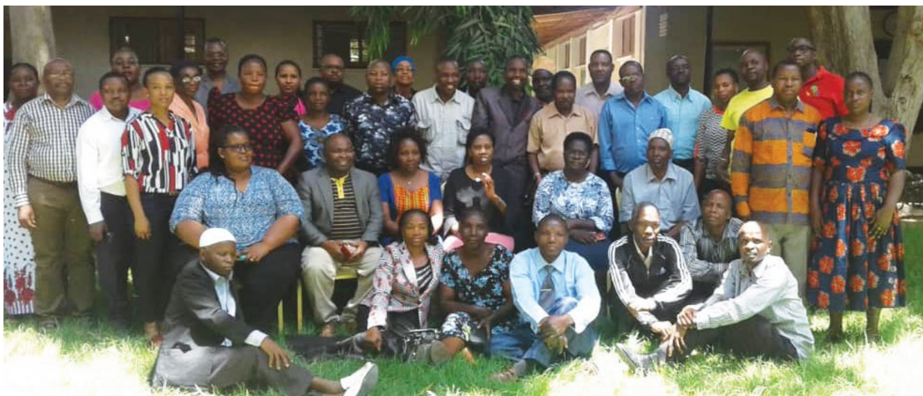
TTCN members during 2018 Annual General Meeting in Morogoro, Tanzania